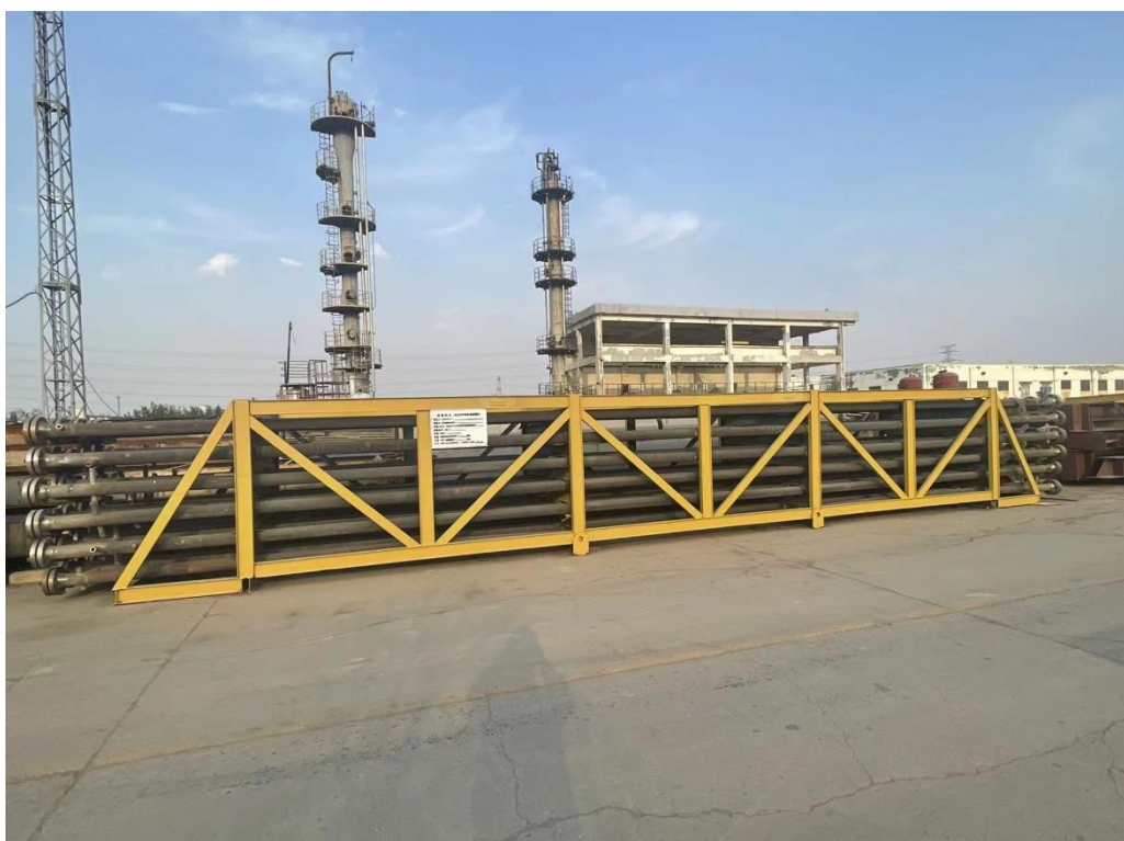
Furnace heat tube