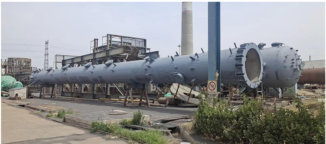
The distillation tower